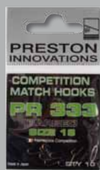
PR333 Micro barb, wide gape, crystal bend, in-turned beaked point, medium fine wire. Bronze finish. SIZES AVAILABLE 12 14 16 18 20 22