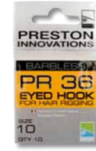
PR36 Barbless eyed hook with out-turned eye. Ideal for hair-rigging for match carp. SIZES AVAILABLE 10 12 14 16 18