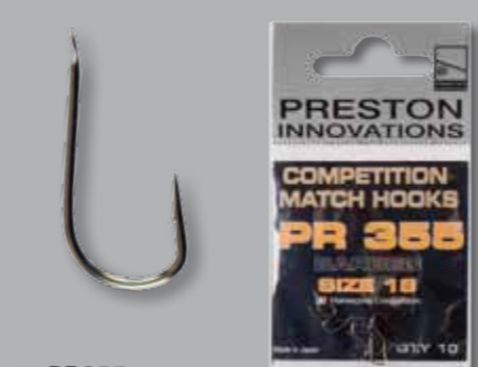
PR355 Micro barb, wide gape, crystal bend, in-turned point, medium heavy wire. Bronze finish.. SIZES AVAILABLE 6 8 10 12 14 16 18