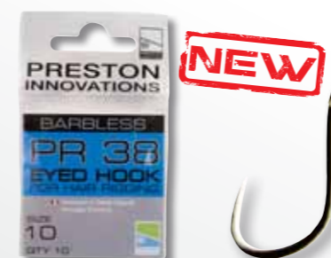
PR38 Same pattern as a PR36 but with stronger wire to suit all match carp applications. SIZES AVAILABLE 10 12 14 16