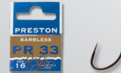
PR33 Barbless, wide crystal bend, in-turned point. Bronze finish. SIZES AVAILABLE 12 14 16 18