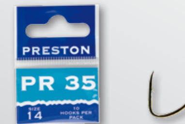
PR35 Micro barbed, wide gape. Bronze finish. SIZES AVAILABLE 14 16 18 20 22 24