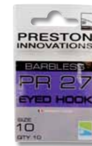
PR27 Eyed, barbless, round bend. Bronze finish. SIZES AVAILABLE 10 12 14 16 18

“PR Hooks are strong and totally reliable. The first choice for many top anglers there are a wide range of styles to suit just about all match situations. When you need a good hook hold you can trust PR hooks.”