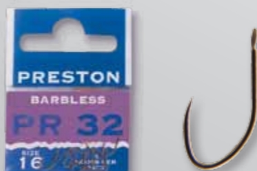
PR32 Barbless, hybrid crystal bend, long in-turned point. Bronze finish. SIZES AVAILABLE 12 14 16 18 20 22