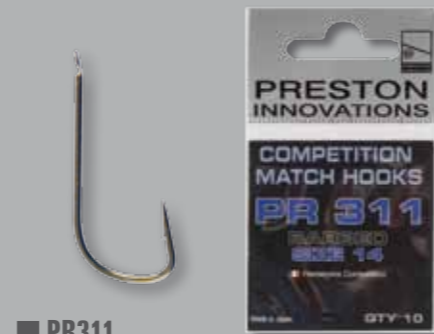
PR311 Micro barb, wide gape, crystal bend, in-turned point, fine wire. Bronze finish. SIZES AVAILABLE 14 16 18 20 22 24