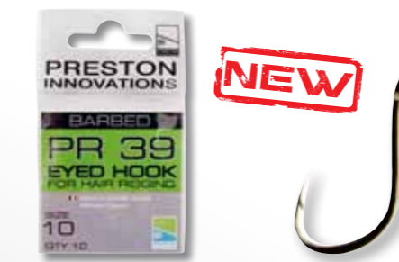
PR39 Same thicker wire as the PR38 but with a barb for situations where barbed hooks are allowed. SIZES AVAILABLE 10 12 14 16