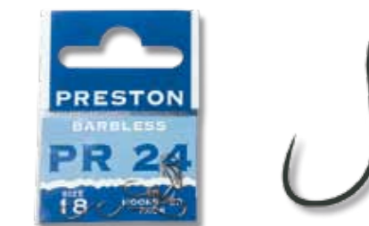
PR24 Barbless, in-turned point. Bronze finish. SIZES AVAILABLE 10 12 14 16 18