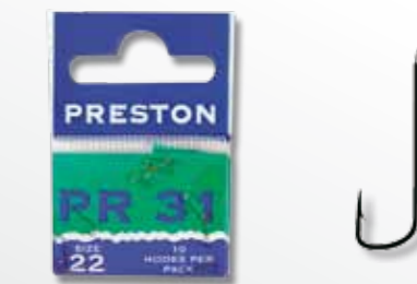
PR31 Crystal type bend, fine wire for squatt, joker and bloodworm. Bronze finish. SIZES AVAILABLE 20 22 24 26