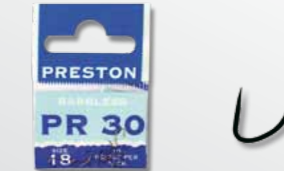
PR30 Barbless, crystal bend, medium wire, bronze. Bronze finish. SIZES AVAILABLE 18 20 22 24 26