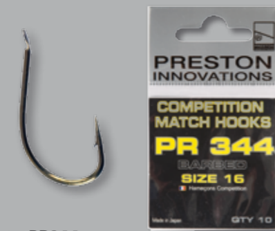
PR344 Micro barb, wide gape, crystal bend, in-turned beaked point, medium wire. Bronze finish. SIZES AVAILABLE 10 12 14 16 18