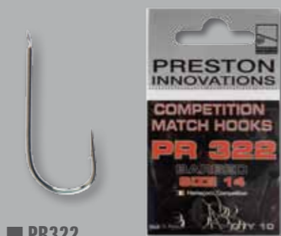
PR322 Micro barb, wide gape, crystal bend, in-turned point, fine wire. Nickel finish.. SIZES AVAILABLE 12 14 16 18 20 22

“The PR Competition range are designed for anglers who prefer to fish with a barbed hook (where fishery rules allow). Made to the same high standards as the original PR range.”