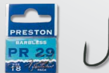
PR29 Barbless, crystal bend, medium shank. Bronze finish. SIZES AVAILABLE 12 14 16 18