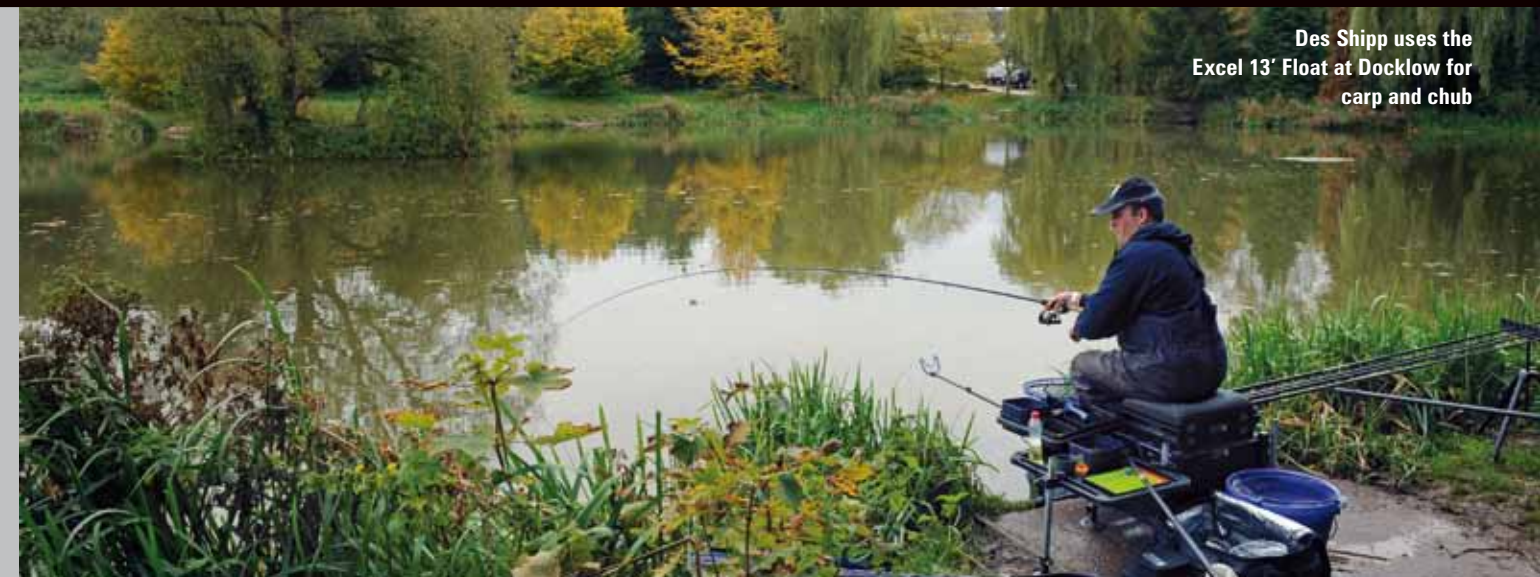
Des Shipp uses the Excel 13' Float at Docklow for carp and chub

“No matter which lake or species you're targeting, the Excel Series provides the answer to the majority of anglers' needs,” adds Des. “It's the ultimate all-round rod range, and with new models being added for 2010, the choice has never been easier.”